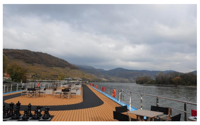
The view of the Danube from the deck