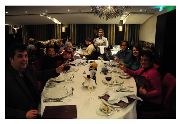
Dinner in the ship's dining room

Travel Protection: Please askyour Travel Advisor about your protection opptions or contact your local provider.