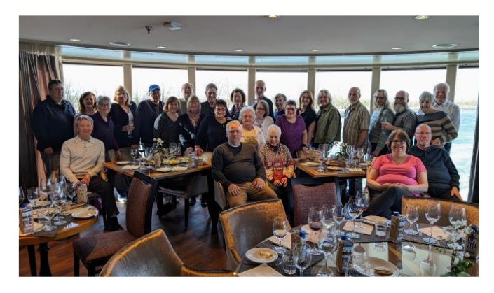
The 2024 Rhine River cruise group at one of our private tastings