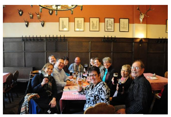
Visiting a local restaurant at a port